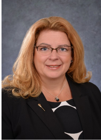
The Honourable Lori Carr Minister Responsible for the Provincial Capital Commission

His Honour, the Honourable Russell Mirasty, Lieutenant Governor of Saskatchewan