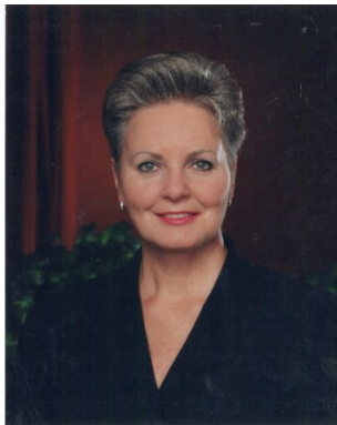
The Honourable Dr. Lynda M. Haverstock, CM, SOM, LLD