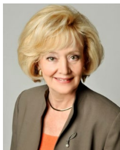
The Honourable A. Raynell Andreychuk, LLD