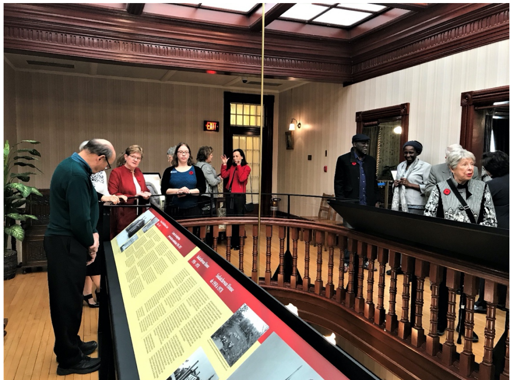
Guests checking out the railing and exhibit at the “Railing Unveiling” event - November 2019